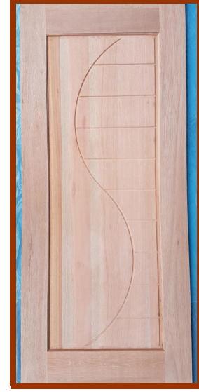
SL-1P & SL-1PS